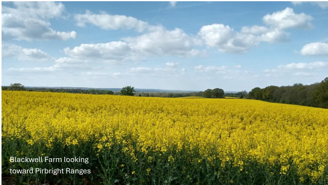
Blackwell Farm looking toward Pirbright Ranges