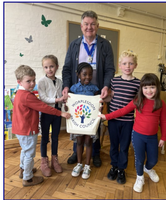
School Council, Wood Street Infant School