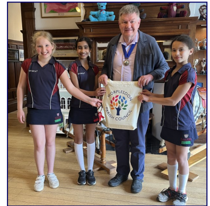
Head Girl and her Deputies, Rydes Hill Preparatory School