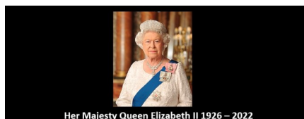
Her Majesty Queen Elizabeth II 1926 – 2022

Worplesdon Parish Council conducted an event at the parish office, and residents of Wood Street Village organised an event to take place on Wood Street Village Green.