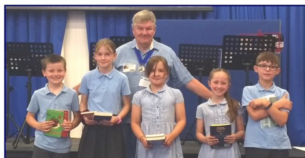
Two groups of children at Worplesdon Primary School receiving books from the Chairman