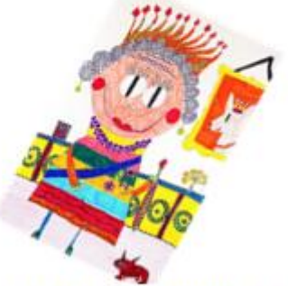
See Art Competition entries and Sime Art Gallery displays