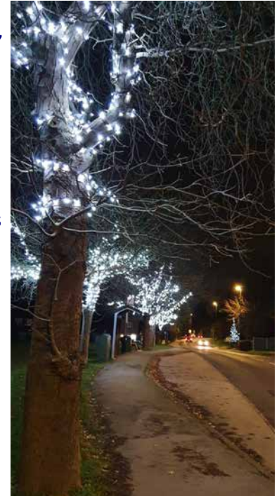
Christmas lights at Perry Hill Green

It is hoped that these lights will, as in previous years, continue to raise spirits and bring enjoyment to the residents of the parish in what has been an exceptionally challenging year.