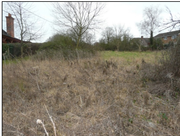
Site of the community car park prior to works commencing - Land to the west of Wood Street Infant School

A lease for the car park was obtained from Surrey County Council – lease runs until 30th September 2073 .