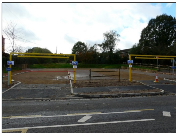
Community Car Park - 28 TH October 2013 – Day of the opening ceremony