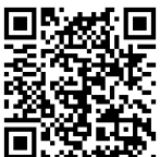
Casual vacancy - QR code

Worplesdon Parish Council is funded by a parish precept element of your council tax payment (currently £4.76 per month per Band D property). Our only other income is from the tennis courts and grants, however, in 2018/19 our income from grants will fall by £18,092.